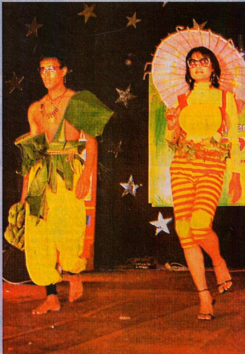
Two models wearing summer attires shshay down the catwalk during a fashion show organised on the occasion of 12th anniversary of Model Star, advertising firm at the Engineers' Institute auditorium on Thursday.