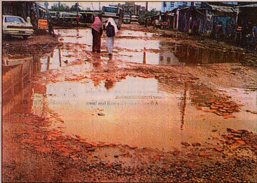
Most of the city streets developed potholes with the onset of rainy seasons, causing untold sufferings to the passers-by as well as passengers. Two female students, on way to school, cross a great hurdle of water-filled and muddy road linking Bahodderhat-Shah Amanat Bridge.