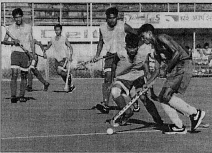
Action from yesterday's ANAS 25th National Hockey Championship encounter between Bangladesh Kira Shikha Protisthan (BKSP) and Narayanganj at the Maulana Bhasani National Stadium.

He begins an official visit to China later this week.