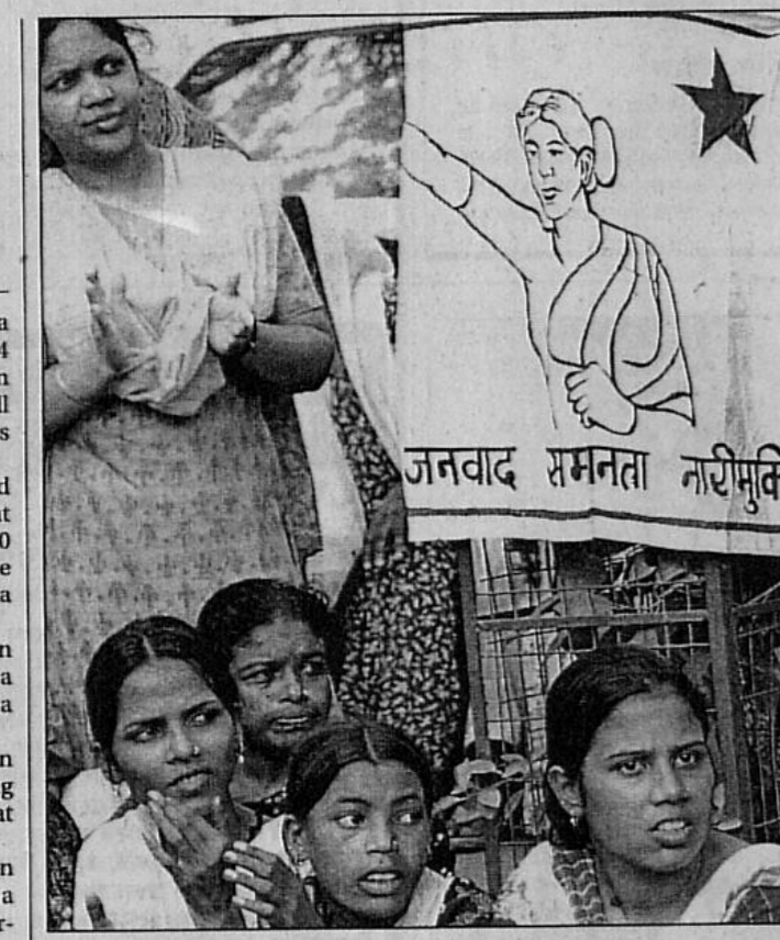
Indian activists of the left-wing All India Popular Women's Committee listen to speech as they display banners during a demonstration near Parliament in New Delhi yesterday.

A bomb threat found mid-flight on a United Airlines plane carrying 264 people forced an emergency return to Sydney yesterday, sparking a full alert in airspace along Australia's eastern seaboard.