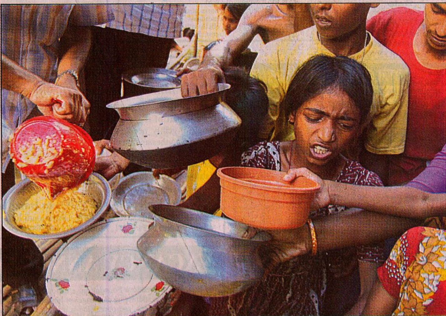
Hungry people scramble for food as members of a carpenters' organisation distribute relief among flood victims near the Bangladesh Television Bhaban in Rampura yesterday.

Meantime, water dispersing from northern areas would continue to gush downstream resulting in worsening flooding in central Bangladesh. SEE PAGE 11 COL 4