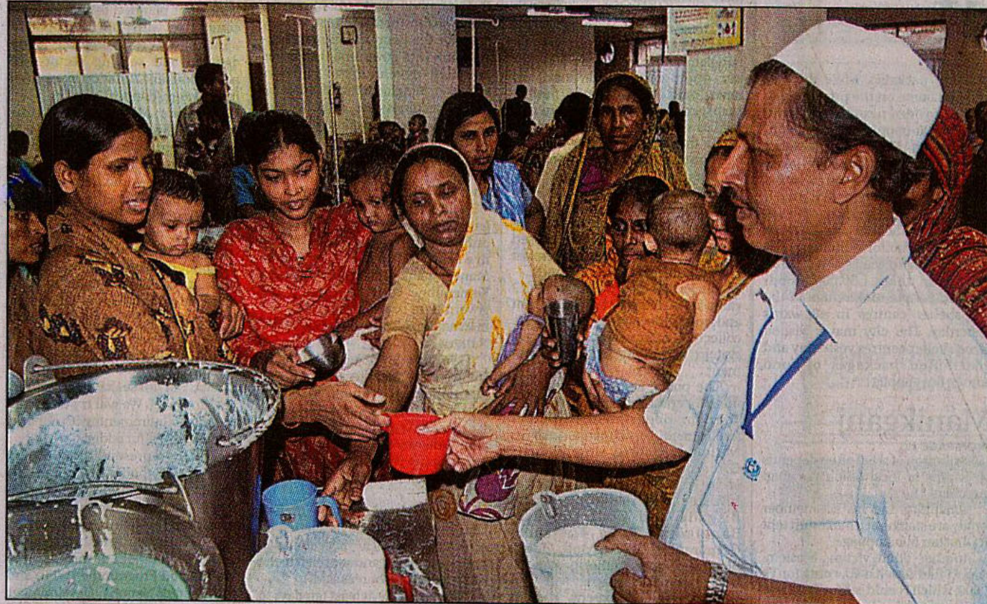
Attendees of diarrhoea patients, mostly children, at the ICDDR,B throng to collect oral saline yesterday. The outbreak of waterborne diseases in the flood-affected areas has already reached an epidemic level.