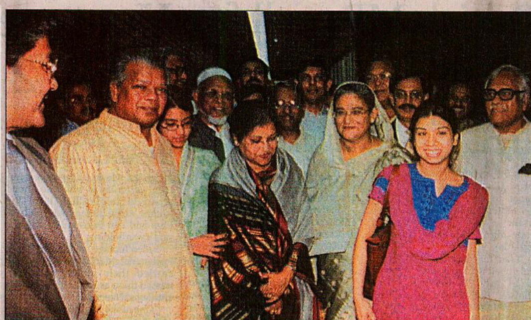
Leader of the Opposition in Parliament and Awami League President Sheikh Hasina with the party leaders who saw her off at the airport in the city yesterday. Hasina left for Delhi on a four-day visit.

In a message to Prime Minister Khaleda Zia, her Pakistan counterpart said, "I'm deeply saddened to learn about the devastating floods in Bangladesh that have caused so much damage to life and property."