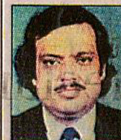
Modhumita Group, says a press release.