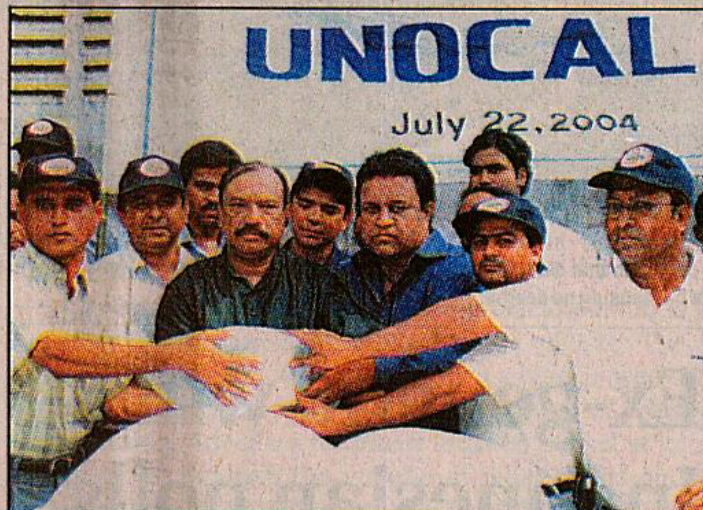
Unocal Bangladesh started distribution of relief materials for flood victims in Sylhet on July 22.