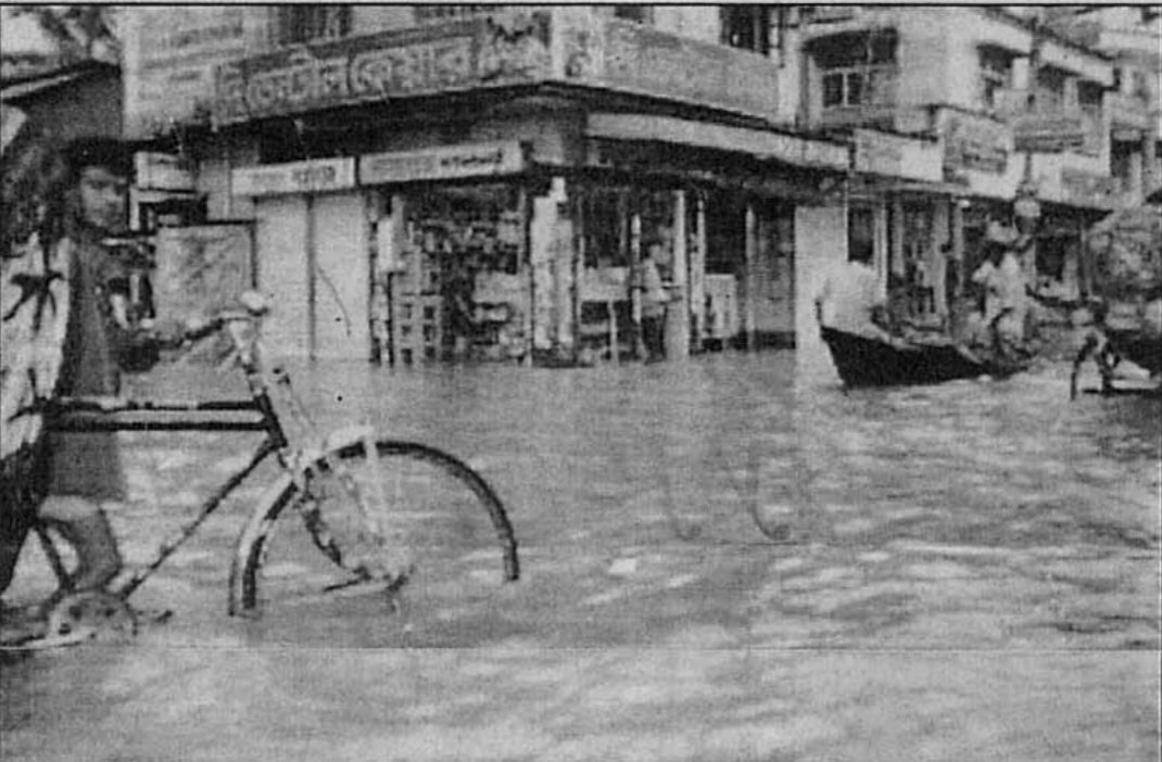
A flood centre at Kalmakanda College in Kalmakanda upazila in Netrakona (left) and boats ply alongside rickshaws on Farooki road in Brahmanbaria town (right). The photo was taken on Saturday.