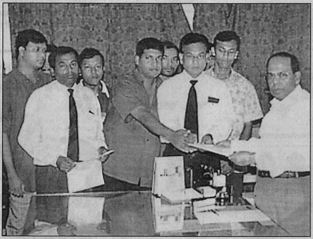
Leaders of the Barisal unit of Hindu Buddha Christian Oikya Parishad submitted a memorandum to the Deputy Commissioner on Saturday demanding steps against communal and terrorist activities by vested quarters, marking observance of its anti-communalism day.

Chittagong Metropolitan Police also picked up 178 persons on various charges from different parts of the city on Friday.