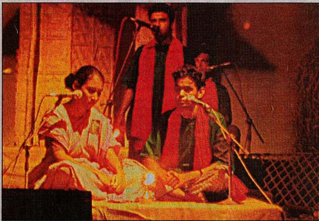
Reciters presenting Bish Brikhker Bee : One of their successful productions