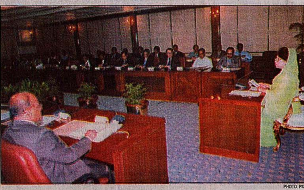
Prime Minister Khaleda Zia chairs a preparatory meeting for the 13th Saarc Summit at the International Conference Centre yesterday.