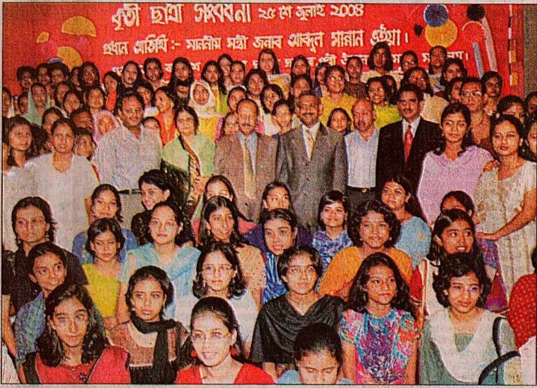
Students of Viquarunnisa Noon School and College who achieved outstanding results in the SSC examinations pose with LGRD and Co-operatives Minister Abdul Mannan Bhuiyan and other guests at a reception ceremony on the school premises yesterday.