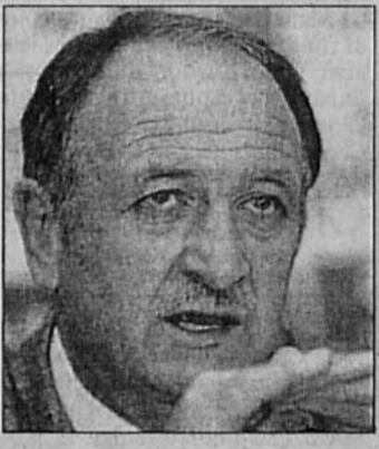
LUIZ FELIPE SCOLARI