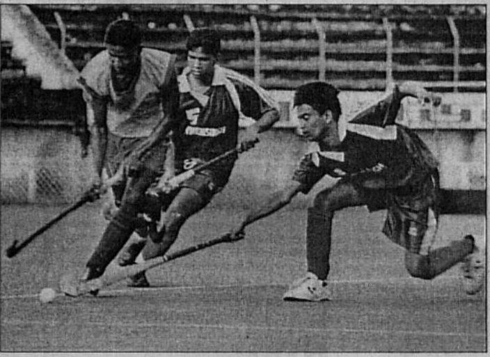
Action from yesterday's ANAS Group 25th National Hockey Championship encounter between Mymensingh and Bangladesh Army at the Maulana Bhasani National Stadium.

However, he could well make his bow at the weekend when United lock horns with Rangers, Feyenoord and Sporting Lisbon in the Newcastle-Gateshead Cup tournament.