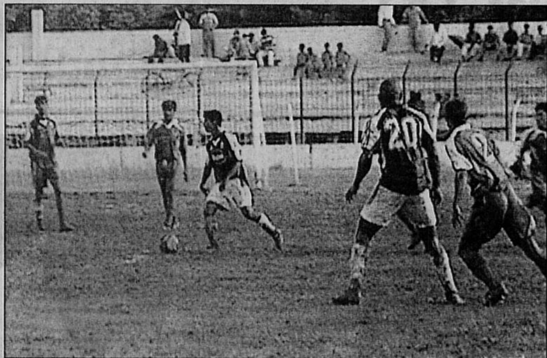
A scene from yesterday's Nitol-Tata National Football League encounter between Sheikh Russel KC and Mohammadan Jhenidah at the Momenshahi Stadium.

The Bangladesh team will return to train tomorrow for their last match against Pakistan on July 29.