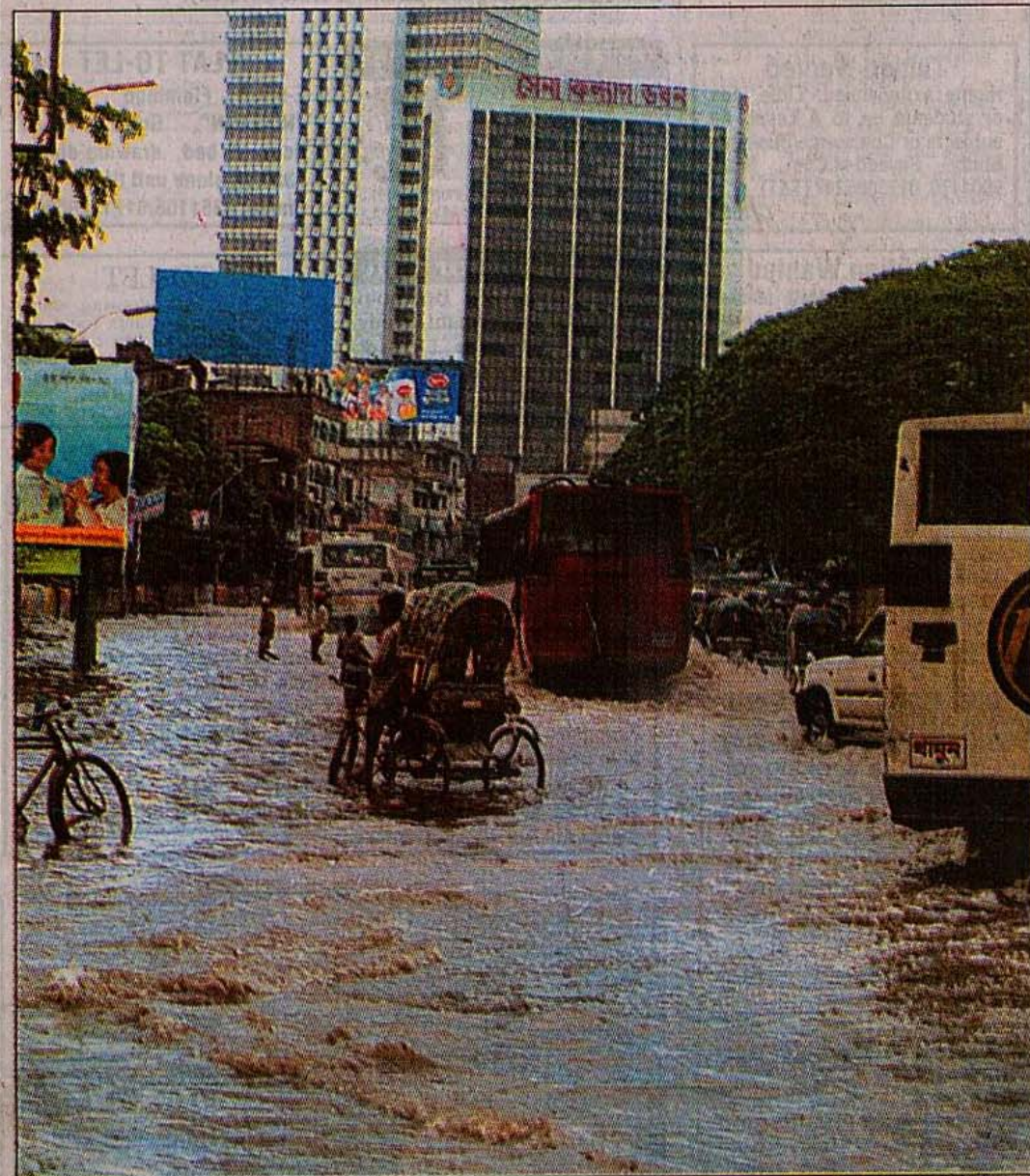
Stinky sewer wastes swamp Motijheel commercial hub as floodwaters rose to the road level in and around the area yesterday, sending a chill down the spine of the businesspeople and residents alike.