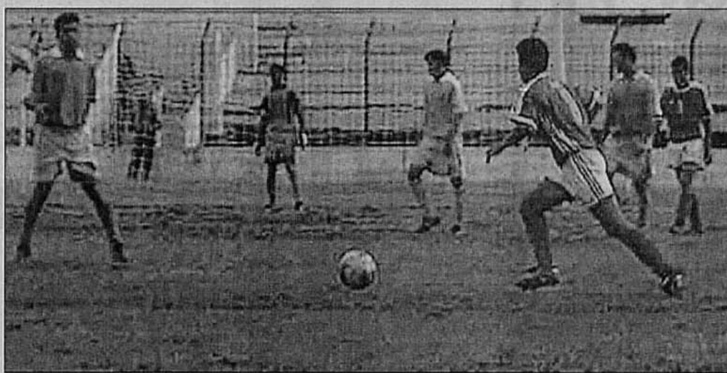
A scene from yesterday's Nitol-Tata National Football League encounter between Bangladesh Air Force and Unmochan Club Bagerhat at the Momenshahi Stadium.