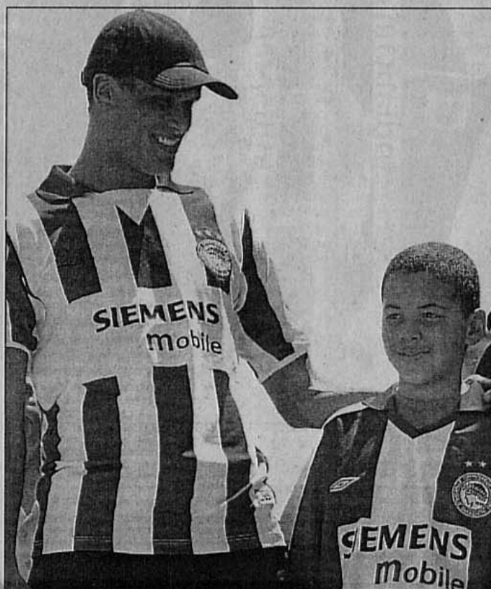
JUNIOR JOINS TOO! Brazilian superstar Rivaldo and his son wear shirts of the Olympiakos football club in Athens on July 22 after the former world player of the year signed a two-year contract with the Greek club.

Rivaldo was greeted by hundreds of fans on his arrival at Athens airport on Wednesday night.