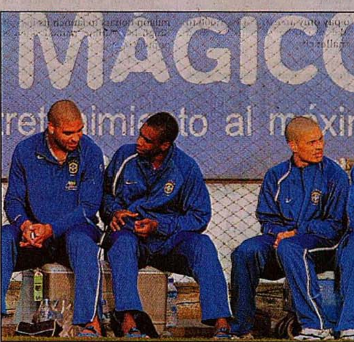
TIME TO TURN ON THE MAGIC! (L) Brazilians footballers (from L to R) Adriano, Juan, Alex and Luis Fabiano relax in front of a board reading "Magic" during a training session at in Lima on July 22. (R) Argentine coach Marcelo Bielsa on his way to a press conference at the team's hotel.