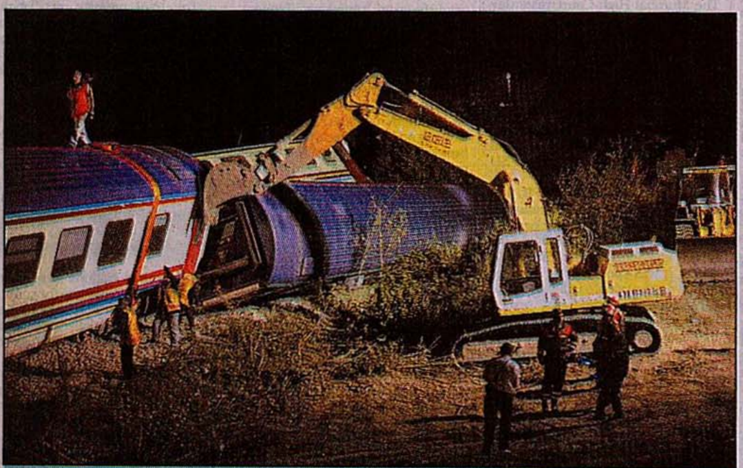
Rescuers work by the train which ran off track near the village of Makeke, west of Istanbul, early yesterday. Thirty-six people were killed and 60 injured when the train crashed on its way from Istanbul to the capital Ankara on Thursday.