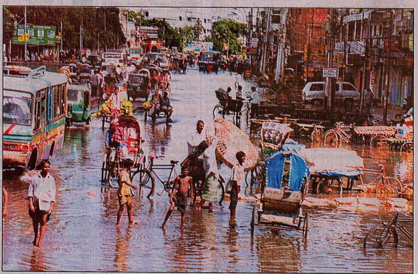
Black stinking sewage water mixed with floodwater swamps the road near Fakirapool Bazaar in the capital yesterday as the rivers surrounding Dhaka continue to swell.

Countries with heavy immigration to the United States, including Canada, China (minus Hong Kong and Taiwan), Colombia, Pakistan, The Philippines, Russia, South Korea, Britain (minus Northern Ireland) and Vietnam, were excluded from the lottery.