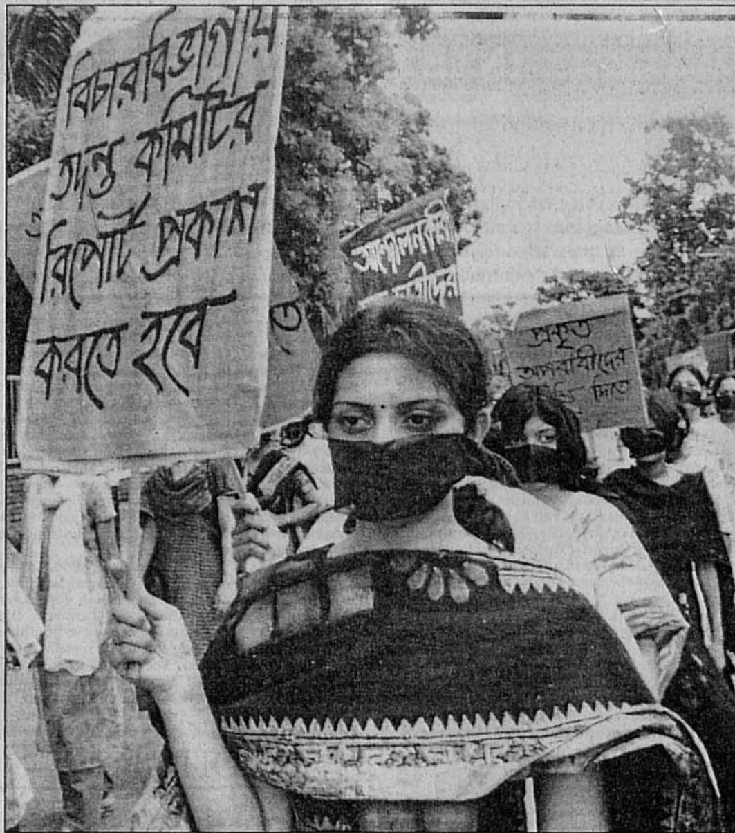
Students of Dhaka University march in a silent procession on the campus yesterday demanding that the probe report on police atrocities at Shamsunnahar Hall be made public.

A milad mahfil will be held at a mosque adjacent to Azimpur graveyard after Asr prayers.