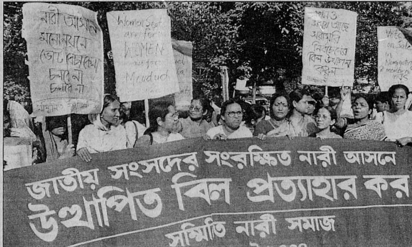
Sammito Nari Samaj stages a demonstration at Muktangan in the city yesterday demanding scrapping of the bill regarding the parliamentary seats reserved for women.

CARE Bangladesh has distributed high-protein compact food to more than 72,000 families in flood affected Sunamganj, Sylhet and Gaibandha districts with the financial support of the USAID, says a press release.