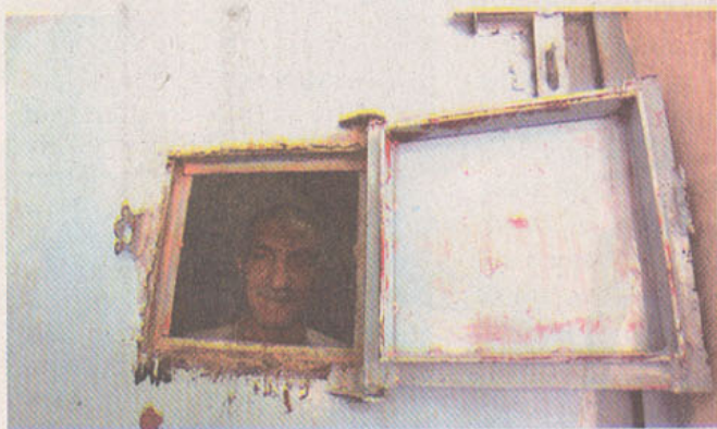
An Iraqi man locked inside a cell looks out from an opening at the Police station in a small town of Lutifiyah near the city of Mahmudiyah, some 60kms south of Baghdad July 2004. The fate of four foreign lorry drivers held hostage in Iraq hung in the balance, while four Iraqis died in flashes of violence as the interim government struggled to impose law and order. There was no news on the fate of two Bulgarians and an Egyptian, but a Filipino hostage made a final plea to his government to pull its troops out of Iraq in exchange for his life.