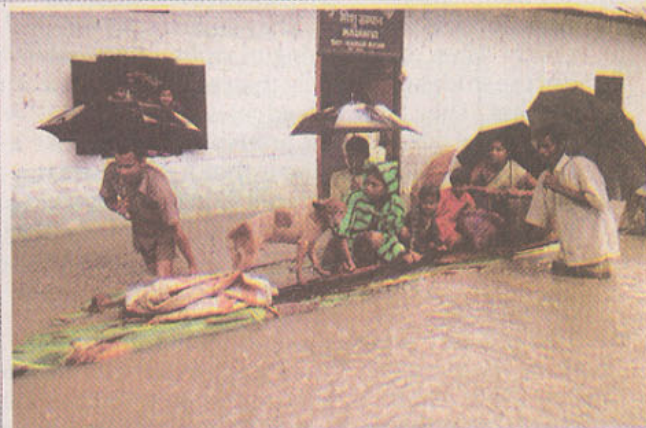
Indian villagers ride on a bamboo raft to escape floodwaters in the village of Deuduar some 40 km east of Guwahati, July 2004. The death toll from floods submerging eastern India reached 78 as five more people died in the northeastern state of Assam when two boats carrying families capsized in the region's central Kamrup District, a police spokesman said. Fifty-five deaths have been reported in northeastern India since annual monsoons began last month, while 23 people have died in the eastern states of Bihar and West Bengal.