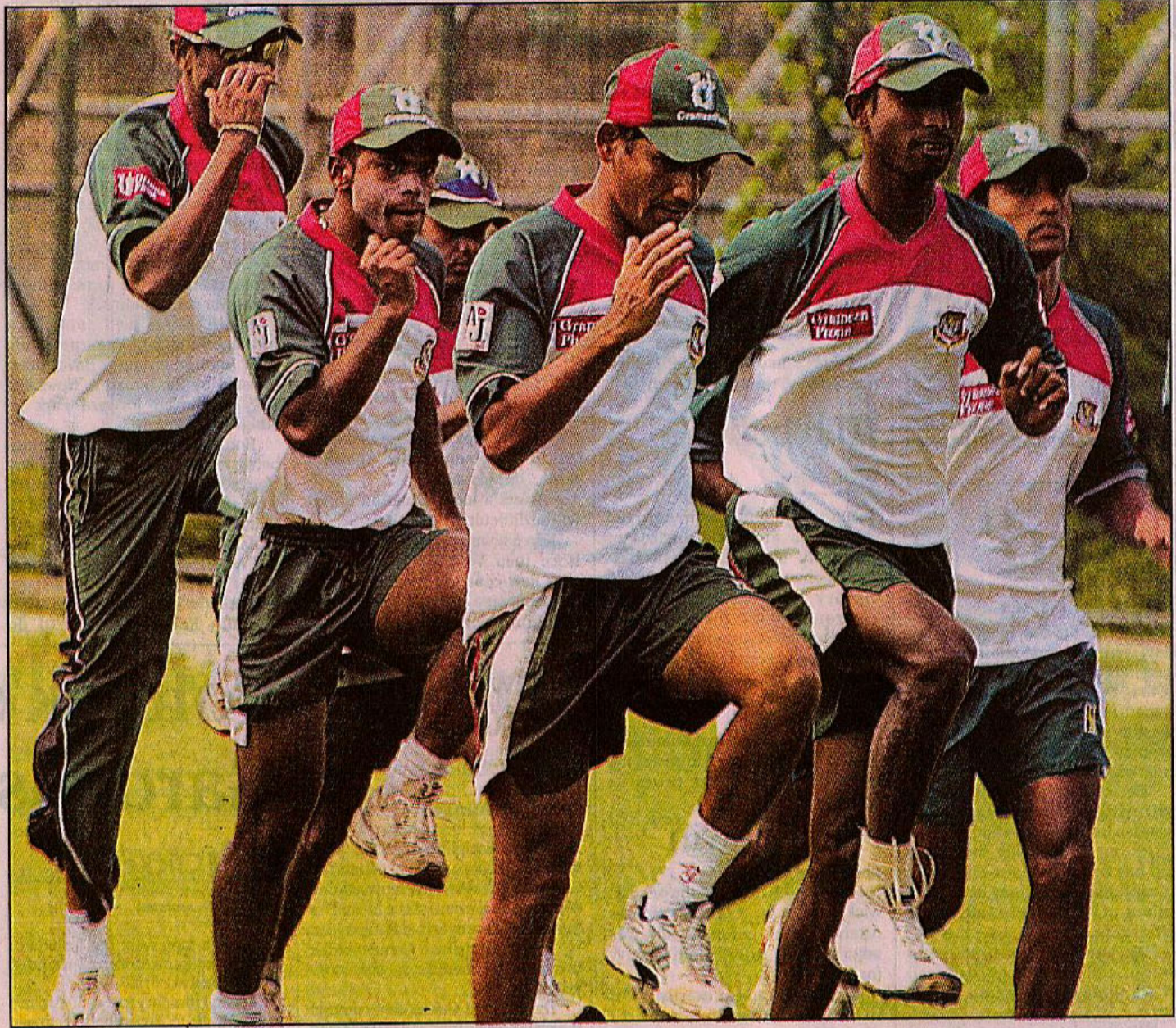
THE FARTHER YOU RUN, THE CLOSER YOU GET TO YOUR TARGET: Bangladesh captain Habibul Bashar (C) leads his team in a warm-up run prior to a net practice session in Colombo yesterday. Bangladesh meet hosts Sri Lanka in the super league of Asia Cup at the Premadasa Stadium today.

SPORTS REPORTER The sixth school chess tournament, sponsored by Standard Chartered Bank, will start at the hall room of the National Sports Council on July 26. The open to all students between Class KG to Ten event requires no entry fee.