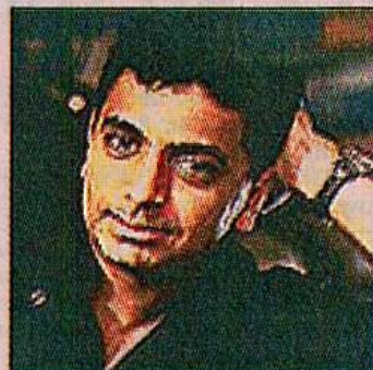
M Night Shyamalan

The show reveals that Shyamalan had, like Haley Joel Osmen's character in The Sixth Sense , seen dead people as a child,