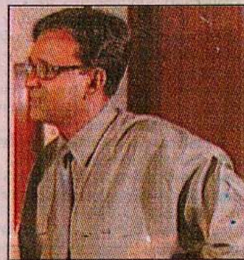
Babarnama. In the play, artistes from five countries—Bangladesh,