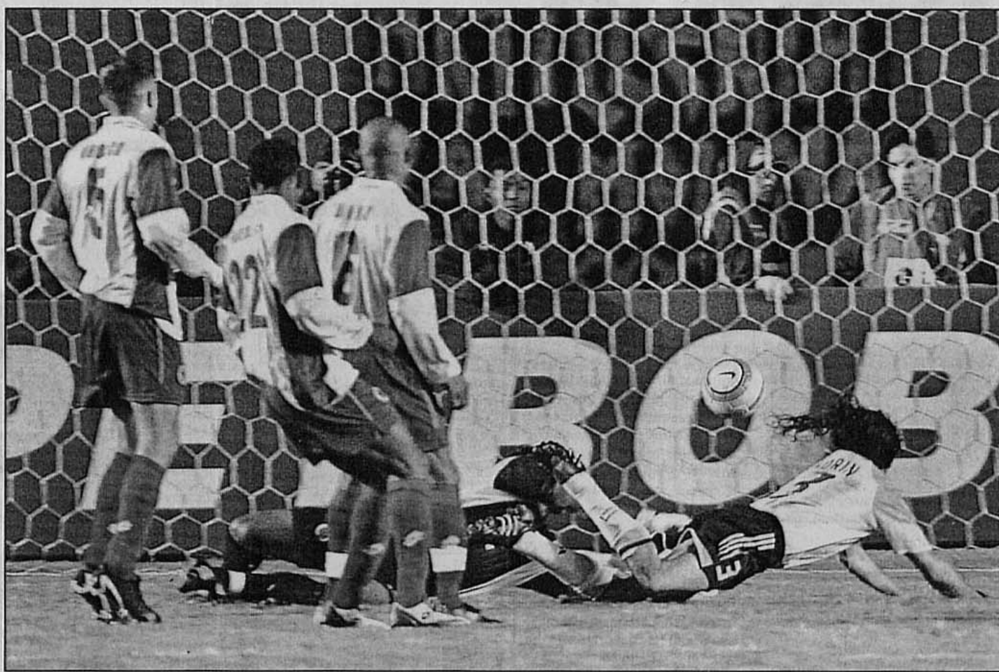
A diving header by Argentina's Juan Pablo Sorin (R) going into the net past Colombian goalkeeper Juan Carlos Henao at the National Stadium in Lima on July 20.

Argentina cruised through the remaining 40 minutes against a hugely disappointing Colombia, who never looked like getting back into the game, and Sorin completed the scoring with a diving header from a Mauro Rosales free kick.