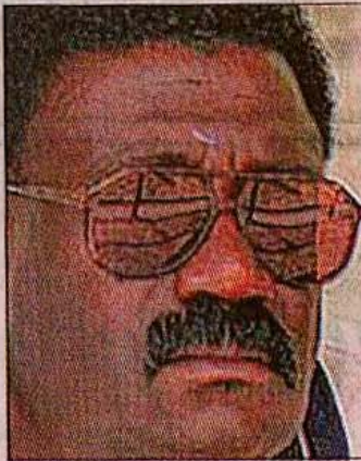
Clive Lloyd (West Indies cricket legend)

"If technology will help, technology should be used. There's a lot at stake in cricket these days and what matters is that we get it right. It's time to use technology to the full extent."