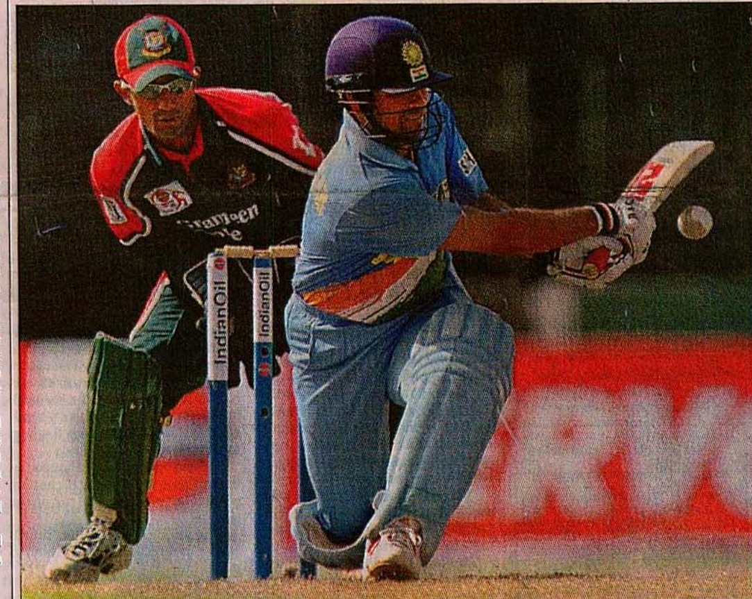
Master Indian batsman Sachin Tendulkar sweeps fine on way to scoring an unbeaten 82, his highest score against Bangladesh, at the Sinhalese Sports Club ground yesterday.

"It is impossible to prepare a proper wicket in the desert inside one year. I don't really see any chance of cricket being held there during the Asian Games."