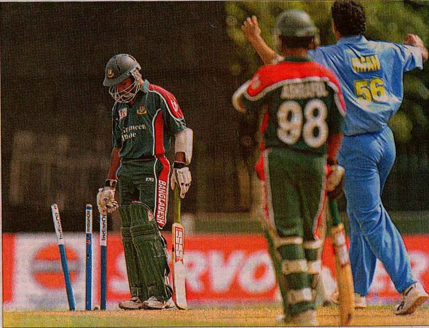
BEGINNING OF A SAD END: Captain Habibul Bashar looks back at his shattered stumps as Indian left-arm paceman Irfan Pathan celebrates the fall of the first Bangladesh wicket at the SSC ground yesterday.