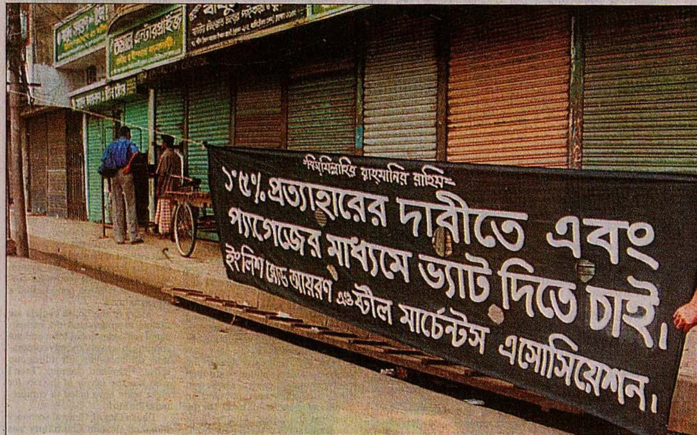
A steel merchants' association hangs a banner in Old Dhaka as most shops kept their shutters down yesterday to press the government into stopping collection of VAT at import level and introducing package system in VAT payment by retailers.

CHANGHONG Color TV "FAMILY" OFFER! Model: H21C51 Model: G21C36 China's NO. 1 Colour TV * One 56" Ceiling Fan Free with every Purchase of 21" Select CHANGHONG Models TRANSCOM ELECTRONICS Tel: Dhaka: 8110163, 9882192, 9896285, 9569613, Bogra: 66215 Chittagong: 637669, 653758, Khulna: 720304, 723695 FREE TRANSTEC Ceiling FAN