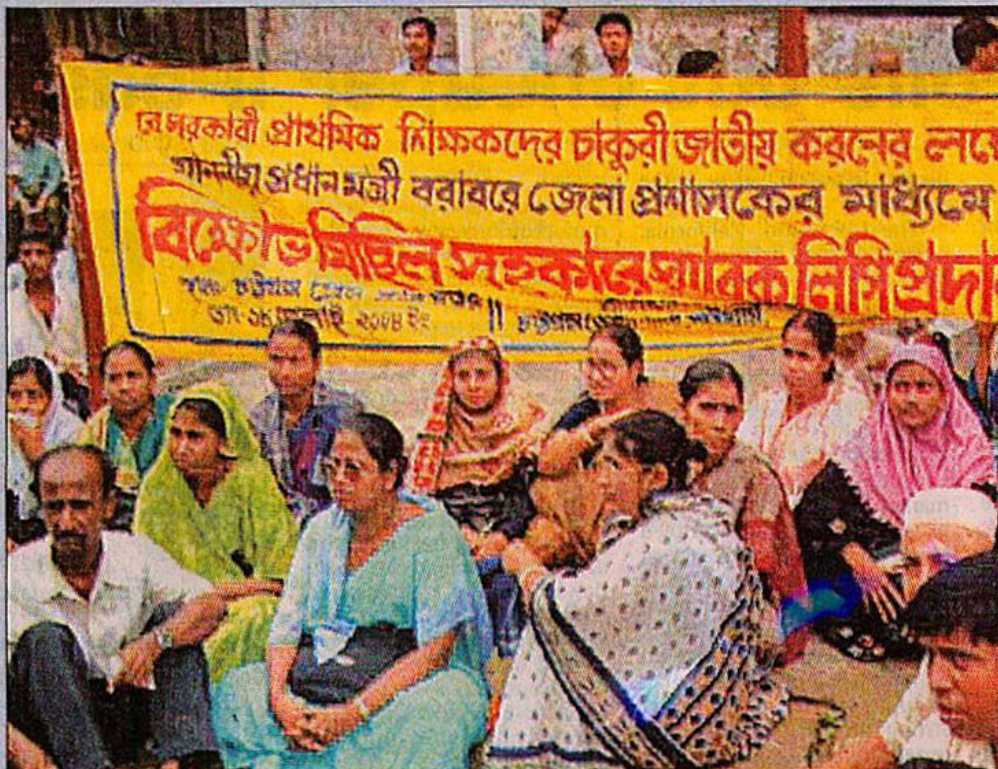
Teachers of non-government primary schools under the banner of Non-government Primary Teachers' Samity held a rally in front of the Chittagong Press Club on Sunday demanding nationalisation of their jobs.

The visitors at the exhibition will see the achievement of France in the field of chemical development and new appropriate system that protects environment and keeps live the business of fuel and raw materials, said a press release.