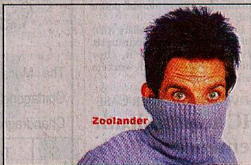
Zoolander On HBO at 9:30 pm Genre: Comedy Ben Stiller, Owen Wilson, Christine Taylor