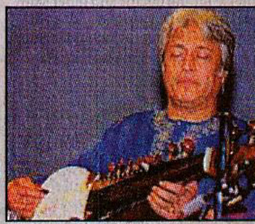
Khan, who has also received the UNESCO Award, the Padma Vibhushan, UNICEF's National Ambassadorship, and Crystal Award, said that 'this was the highest award of his life'. Khan maintained that the future of Indian classical music, despite facing stiff competition from fusion music and remixes,

This is the second time an Indian has been chosen for the Grand Prize. Sarod maestro Pandit Ravi Shankar was the first recipient in 1992.