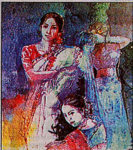
Intimacy, Mixed media