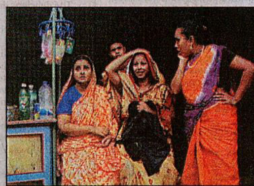
The play depicts the down trodden people