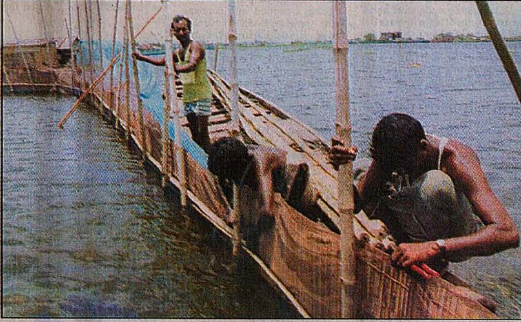
Fish farmers in Kazla area in Demra raise a bamboo fencing to save fish amid a rise in water levels triggered by monsoon rains and water overflows.