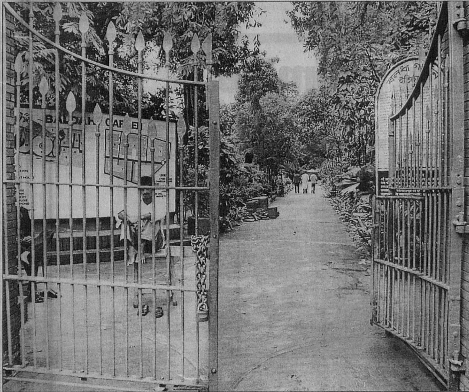
The barren gate of the Baldah Garden.