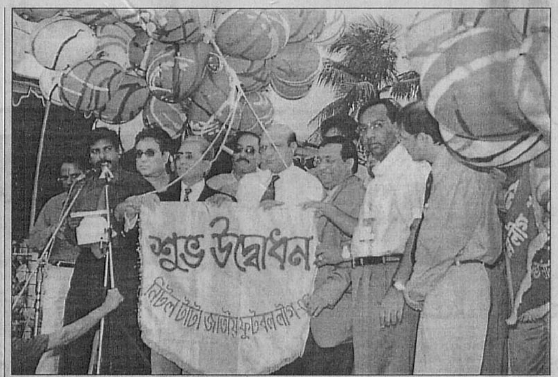
State Minister for Energy and Mineral Resources AKM Mosharraf Hossain inaugurates the final round of the Nitol-Tata National Football League at the Momenshahi Stadium yesterday.