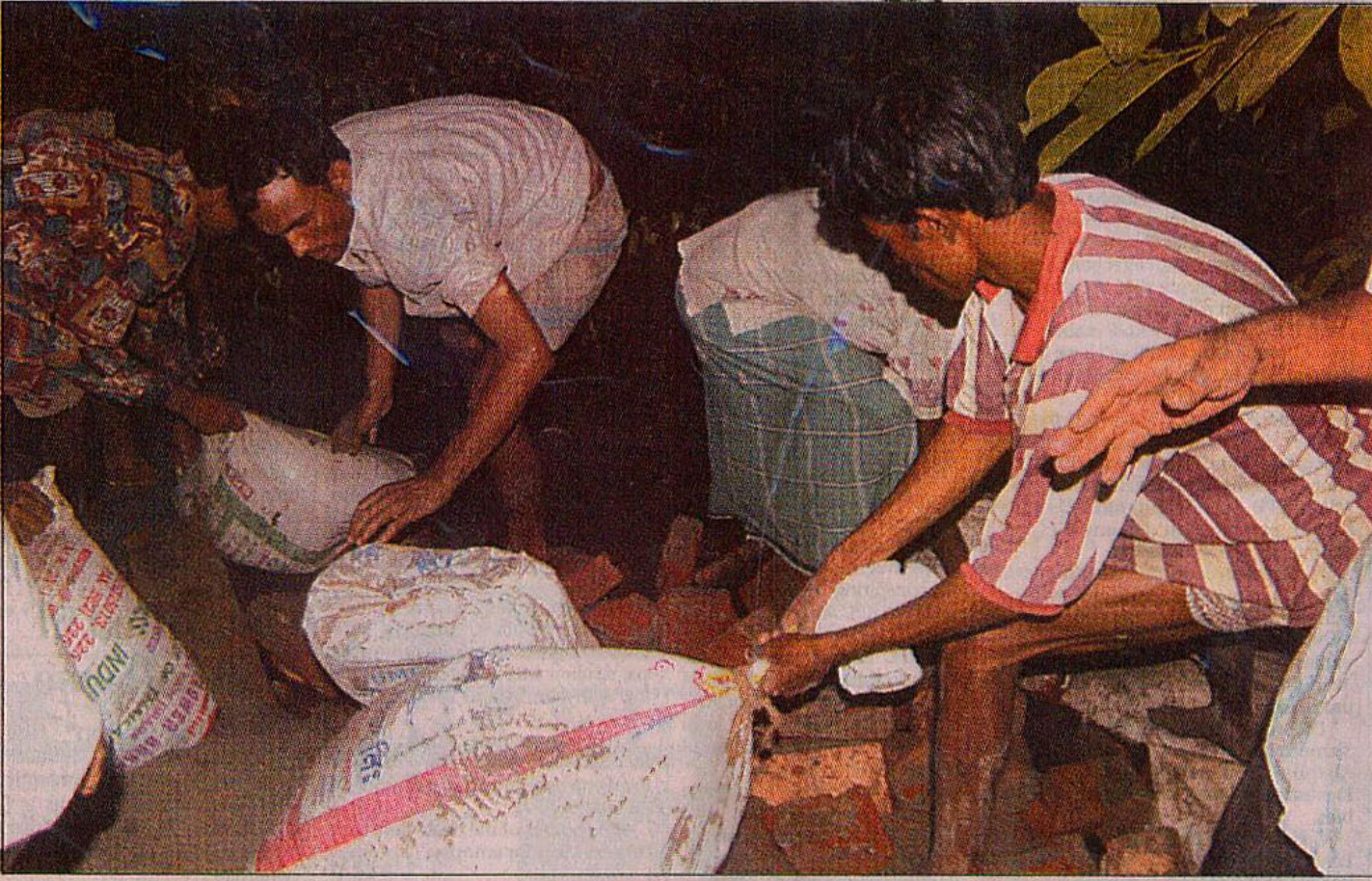
Workers fight against time to fill up a crack that appeared in the Dhaka-Narayanganj-Demra flood protection embankment at Della in Demra last night sparking off panic among the city-dwellers.

The district administration and Bangladesh Inland Water Transport Authority (BIWTA) on the second day of the five-day demolition drive knocked down 39 illegally set up structures on the Buriganga river yesterday. The joint drive is part of initiative taken by the authorities to rid the river of thousands of encroachment points and ensure its navigability and free flow of water. The demolition team yesterday knocked down a concrete and two semi-concrete structures and tinshed shanties. In Keraniganj, the SEE PAGE 11 COL 6