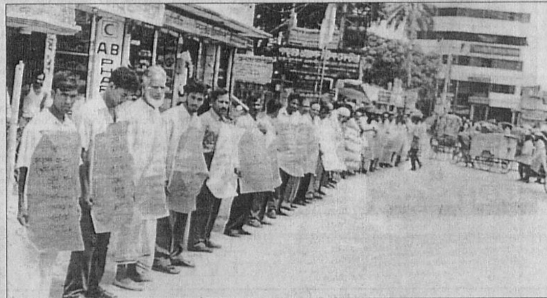
Freedom fighters formed a human chain in Brahmanbaria town yesterday in observance of their Demand Day. Their demands include Tk 2000 monthly allowance for each freedom fighter. They also held a discussion meeting earlier on the day.