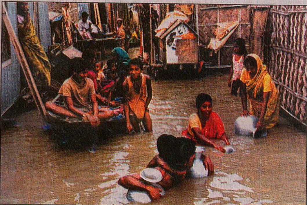
Women in the submerged Shamurbari area in Munshiganj collect floodwaters for household use, raising fears for outbreak of diseases.