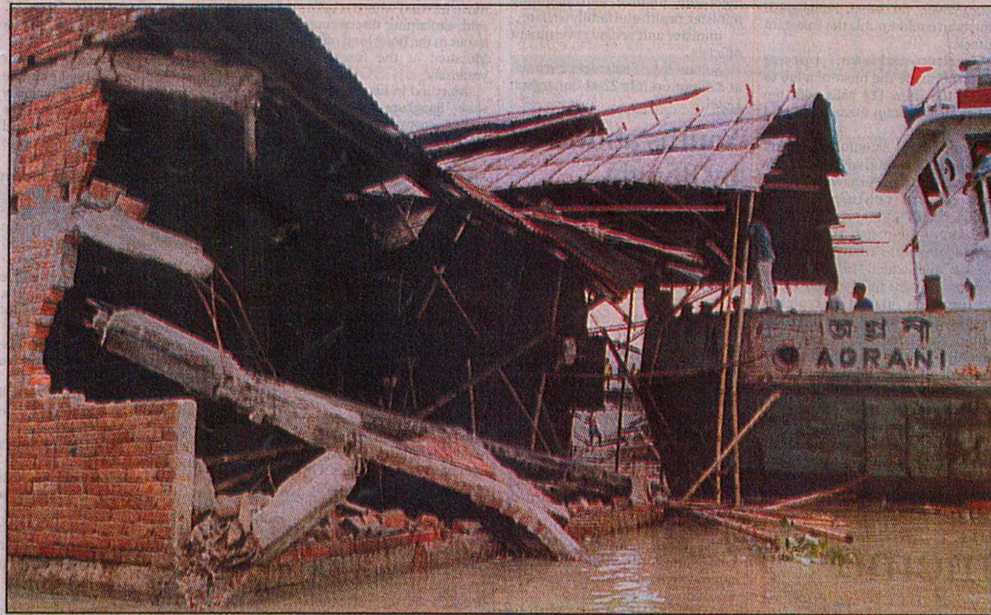
An illegal structure encroaching on the Buriganga River at Kamrangir Char was knocked down yesterday, the first day of a five-day drive.