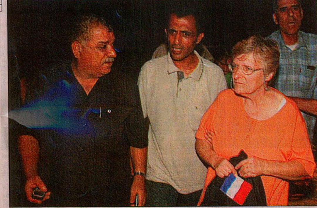
Palestinian security officers escort a French humanitarian worker (R) after she and another female were released by Palestinian gunmen at the Red Crescent Society headquarters in Khan Yunes refugee camp in the southern Gaza Strip late Friday.

(CSIS) a Washington think-tank. "The public in each case reacts quite differently. In the United States, opinion is less excited than in Europe, even in Great Britain, over the fact that the mountains of weapons of mass destruction have not been found," he said.