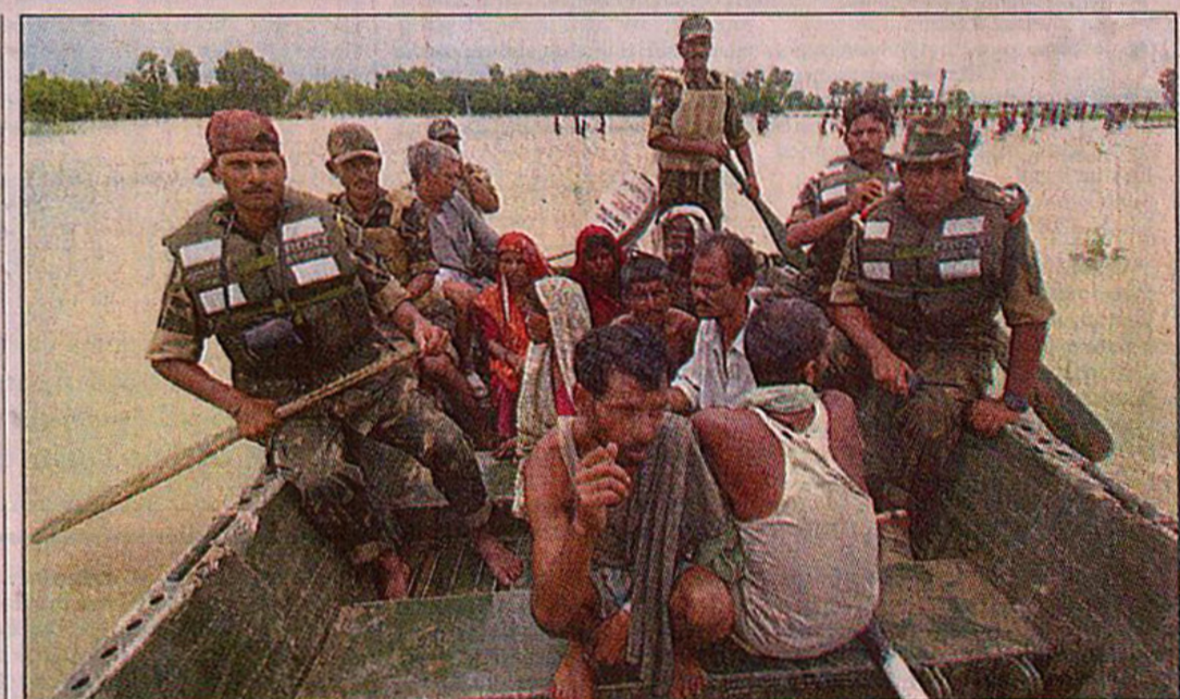
Indian army personnel rescue residents of Tetariya village in the Muzaffarpur district of the Indian state of Bihar, some 105km north of the state capital, Patna yesterday.