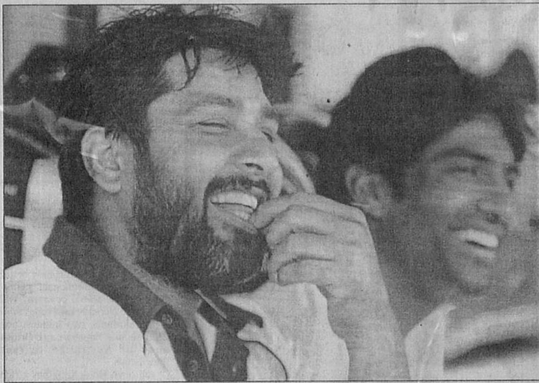
Pakistan skipper Inzamamul Haq (L) and batsman Yousuf Youhana find something amusing as they relax during a practice session in Colombo yesterday.

Three teams will qualify in the six-team second phase final round to be held at the Sher-e-Bangla National Stadium in Mirpur.