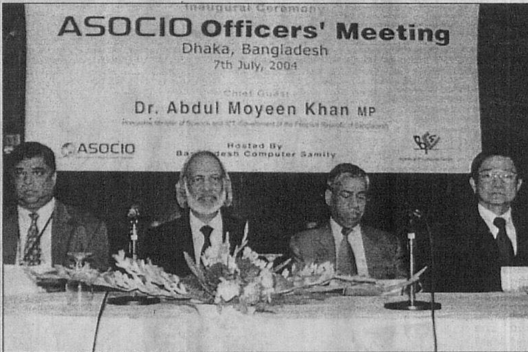
Panel of guests at the formal inauguration ceremony

The Asocio Award nomination and 20th anniversary sub-committee meeting was held on July 5. Executives from the member countries were also nominated for awards for their total contribution in the development of Asocio.