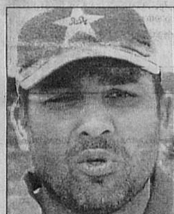
Inzamamul Haq (Pakistan cricket captain)

"My team is now revitalised and after some organised coaching I am confident that we will successfully defend our title." On the upcoming Asia Cup.