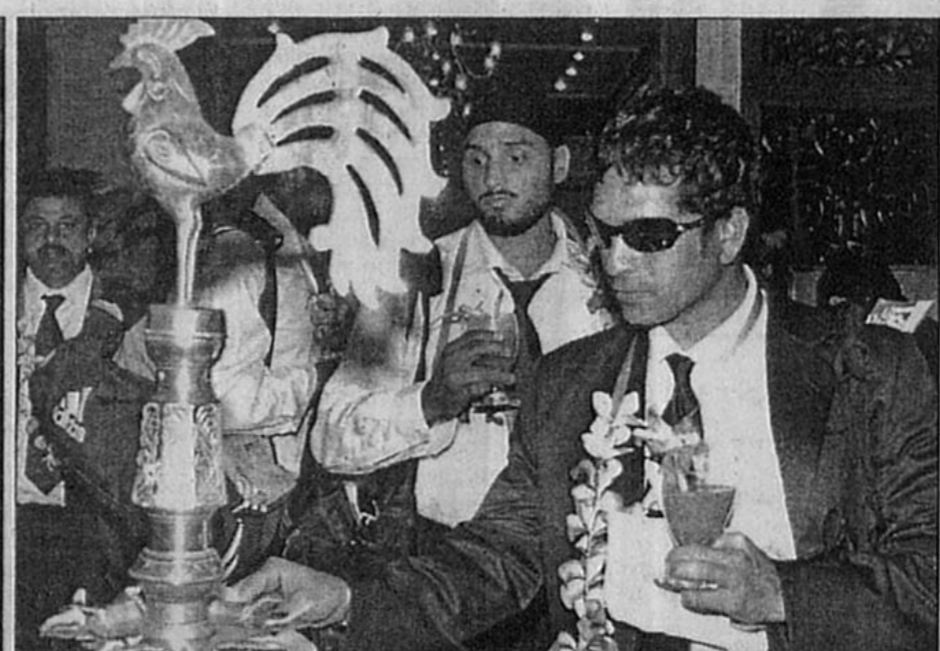
COMBATANTS IN COLOMBO: (L) Pakistan fast bowler Shoaib Akhtar is garlanded by a lady at the team's hotel after arriving in the Sri Lankan capital yesterday. (R) India's master batsman Sachin Tendulkar lights a ceremonial oil lamp at the team's hotel while teammate Harbhajan Singh (2nd from R) looks on.