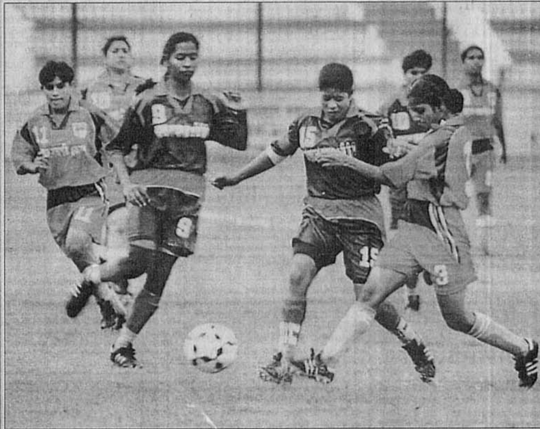
Scene from an exhibition women's football match between Bangladesh Football Federation President's XI and Bangladesh Ansar and VDP at the Shaheed Mustafa Kamal Stadium in Kamalapur yesterday.