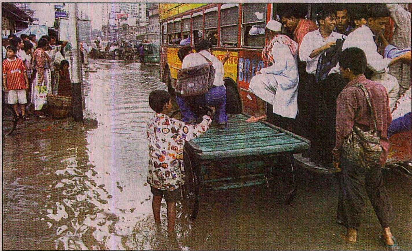
The waterlogged city created a new business opportunity yesterday. Passengers take help of rickshaw-vans to get down from and board buses at Shantinagar to avoid being drenched in rainwater for Tk 1 each.