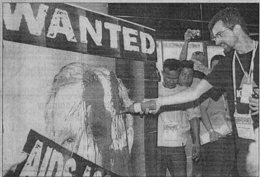
AIDS activist sprays color on the portrait of the US President George W. Bush during a demonstration outside the 15th International AIDS conference hall in Bangkok yesterday.