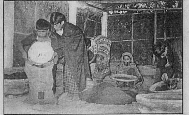
A family in Khaserhat village producing 'vermicompost' for sale.

Vermicompost is more effective for all crops than chemical fertiliser and has no side effect, said Anisur Rahman of the Centre for Mass Education in Science (CMES), an