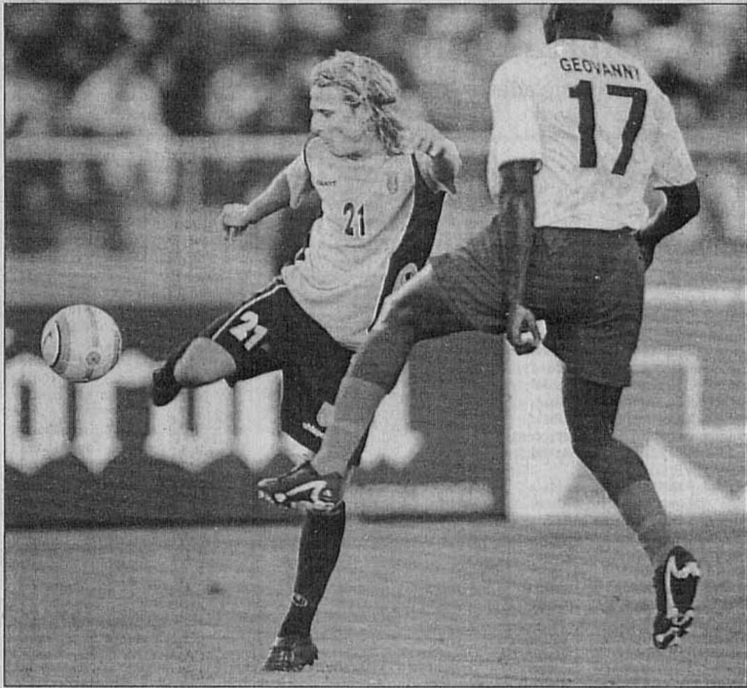
Uruguay's Diego Forlan gears up for a volley during their Group B match against Ecuador at Elias Aguirre Stadium in Chiclayo city on July 10.