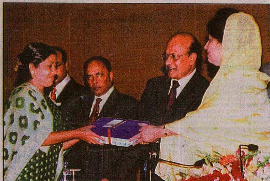
Prime Minister Khaleda Zia yesterday distributes awards among individuals and organisations for their outstanding roles in checking population boom on World Population Day at Bangladesh-China Friendship Conference Centre.