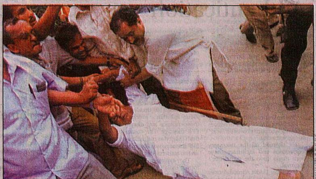
President of the Communist Party of Bangladesh Manjurul Ahsan Khan has been pushed down to ground by police as the left-leaning 11-Party tried to bring out a procession in support of today's hartal called by trade unionists.