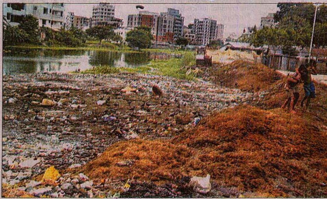
Heaps of stinking, hard-to-recycle garbage dumped onto the Gulshan Lake near Aarong, posing grave threat to the environment and public health alike. A boy, right, shows yesterday his catch, a few among thousands of fish that died reportedly from chemical poisoning over the last three days in the lake because of pollutants released by industrial units in Teigaon.