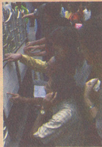
The hectic search for the result is a nerve-wracking experience.