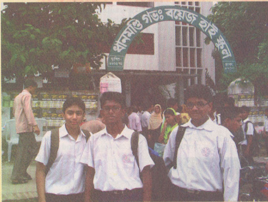
Bangla medium has utterly failed to nurture the creative abilities of the youngsters.

education officials is associated with this corrupt practice," she adds.