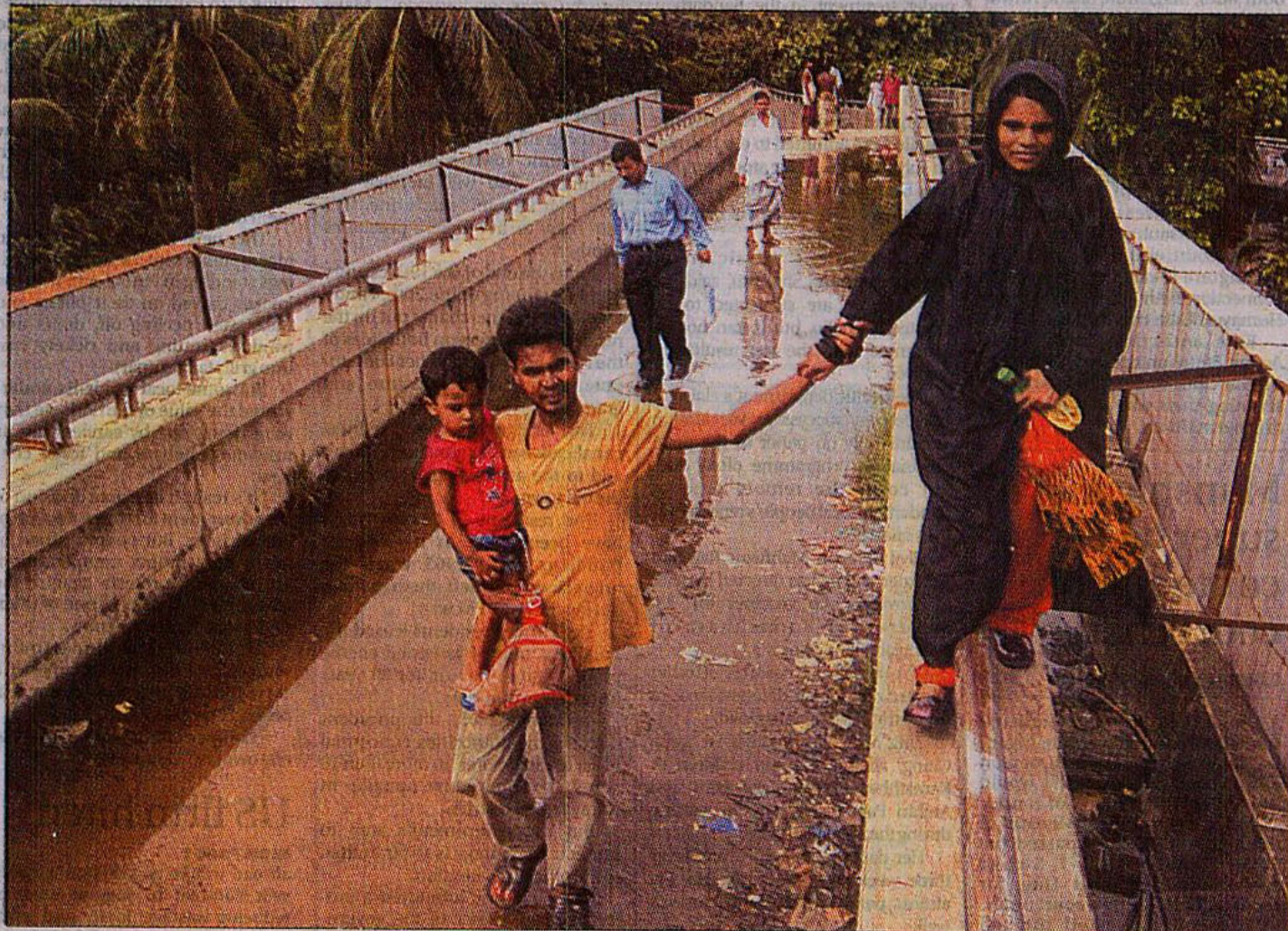
A woman walks on the concrete railing to avoid trudging through rainwater and rubbish littering the footbridge linking Ramna Park to Suhrawardy Udyan yesterday. The footbridge has no system to drain out rainwater.