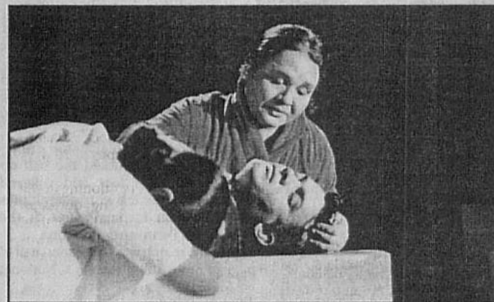
A play well worth watching

After two below quality productions, theatre goers were in for a welcome break. On July 6, they got to see Aamar Shantan Aamar Aanchal , a well crafted production of Nagorik Natyangan Ensemble at the Experimental Theatre Stage.