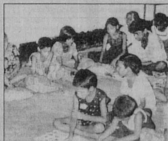
No table, no chair. Children of Harijan families taking lessons at the lone school for them at Chaitannya Polli in Kushtia town (left) and three girls learning sewing at FAIR office. The photos were taken recently.

It also provides training to elders on different vocations including tailoring, sewing and livestock and poultry raising.