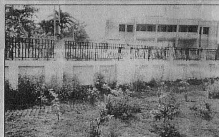
No body knows when the massive structure will be utilised. The Bhola Fire Brigade station was completed about three years back, but not yet manned and equipped with equipment.

BDR raided the house, but it was late. All were herded across the border before BDR personnel reached, according to BDR Captain Kazi Zahur.