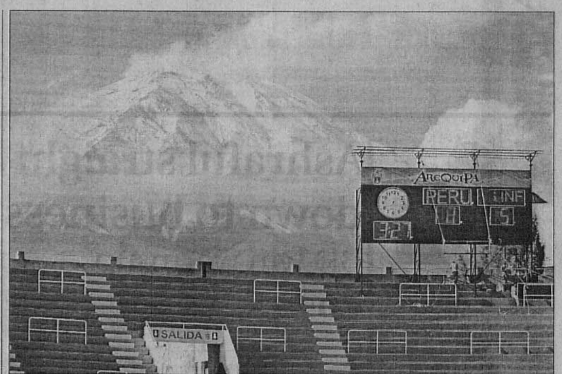
PLEASE DON'T ERUPT! The Misti volcano sits in the background as workers prepare the electronic board at the Monumental stadium in Arequipa, southern Peru on July 5.

Mexico have brought a full-strength squad to the tournament, where they face Argentina, Uruguay and Ecuador in first round Group B.