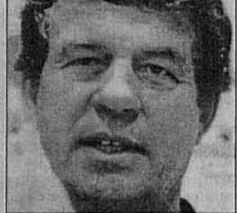
Otto Rehhagel (Greek soccer coach)