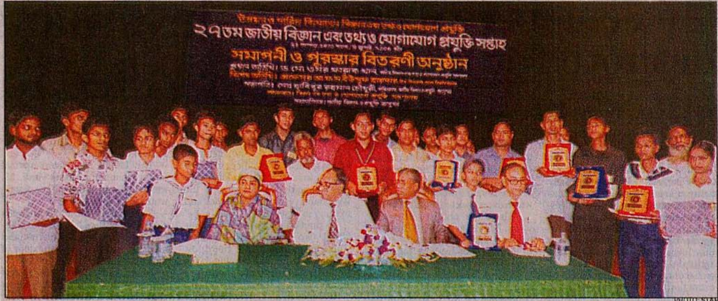
Winners of the 27th National Science and Information and Communication Technology Week pose for photograph with the guests at the Osmani Memorial auditorium in the city yesterday. Science and Information and Communication Technology Ministry organised the event.