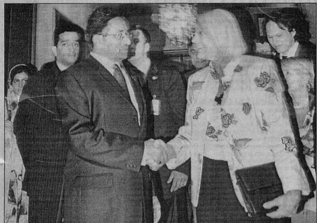
Swedish Foreign Minister Laila Freivalds (R) greets Pakistan President Pervez Musharraf before their meeting yesterday in Stockholm. Musharraf, the first Pakistani president ever to visit Sweden, will visit Finland next.